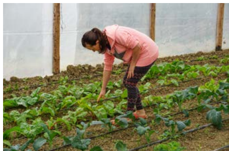
Switzerland provides support to help farms market their products in Bucharest and Ploiești.

Many Romanian SMEs lack the collateral needed to qualify for a loan. Switzerland is therefore contributing CHF 24.5 million to a fund which enables creditworthy SMEs in eight selected sectors to access the finance they need to grow. With the fund as collateral, one of Romania's leading commercial banks is offering secured loans of up to CHF 300,000 to help SMEs invest in their business and improve their competitive standing. By the end of 2018 it had financed over 460 loans, securing some 3,000 jobs to date.