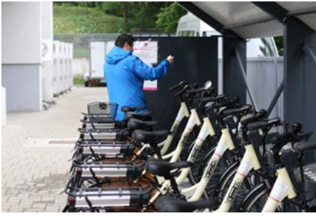
By promoting electromobility, Suceava can save on energy costs and reduce air pollution and noise in the city.