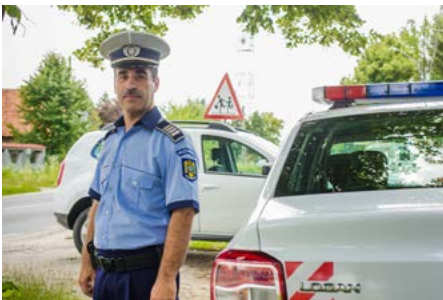
Training in Roma culture and language is helping police officers to build trust among the Roma community. This makes it easier to solve problems at local community level.

Switzerland is supporting the reform of the Romanian police. Around 2,500 police officers took part in training courses on communication and mediation, both of which are indispensable skills for community policing. In addition, 240 officers took a course in Romani to learn the language of the Roma. This is helping to improve security in rural areas. Furthermore, a workshop has been set up in which offenders perform services in communities. Replacing prison sentences by community service increases the chances of reintegration.