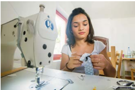
Many skilled workers leave Romania due to a lack of prospects. That is why social institutions are being given support to help create job opportunities and social prospects for the local population.

Around 40 projects in Romania are promoting the exchange of knowledge and experience between Swiss and Romanian civil society organisations. This has benefited some 200 experts in fields such as environmental protection, social welfare and health. In addition, around 100 Romanian NGOs active in these areas have also received financial contributions to build their institutional capacity. As the mouthpiece of civil society, they actively participate in political decision-making processes.