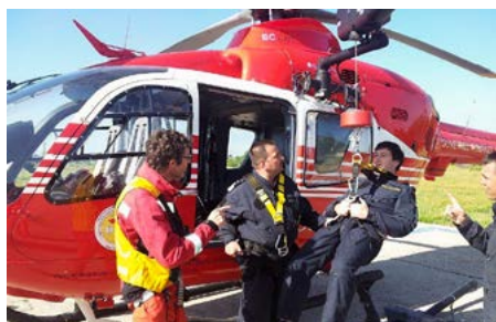
With many years of valuable know-how, Swiss Air-Rescue Rega is helping to improve Romanian rescue services.

As part of a partnership, Swiss Air-Rescue Rega organised and coordinated training courses for Romanian helicopter pilots. 34 pilots upgraded their flight techniques in 47 training modules. Another 30 aircraft maintenance and flight mechanics also received basic safety training.