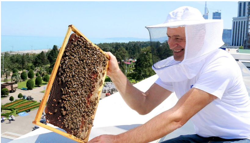
Urban honey production: beehives on a rooftop in Batumi, Georgia.

Livestock farming is an important source of income for a large part of the rural population in Georgia, Armenia and Azerbaijan. But many farmers live from subsistence farming and produce just enough food for their own needs. The aims of the project are to strengthen smallholder farms and to provide them with access to markets. This way, farmers can sell their honey, meat, cheese and wool products, and to sustainably increase their incomes.